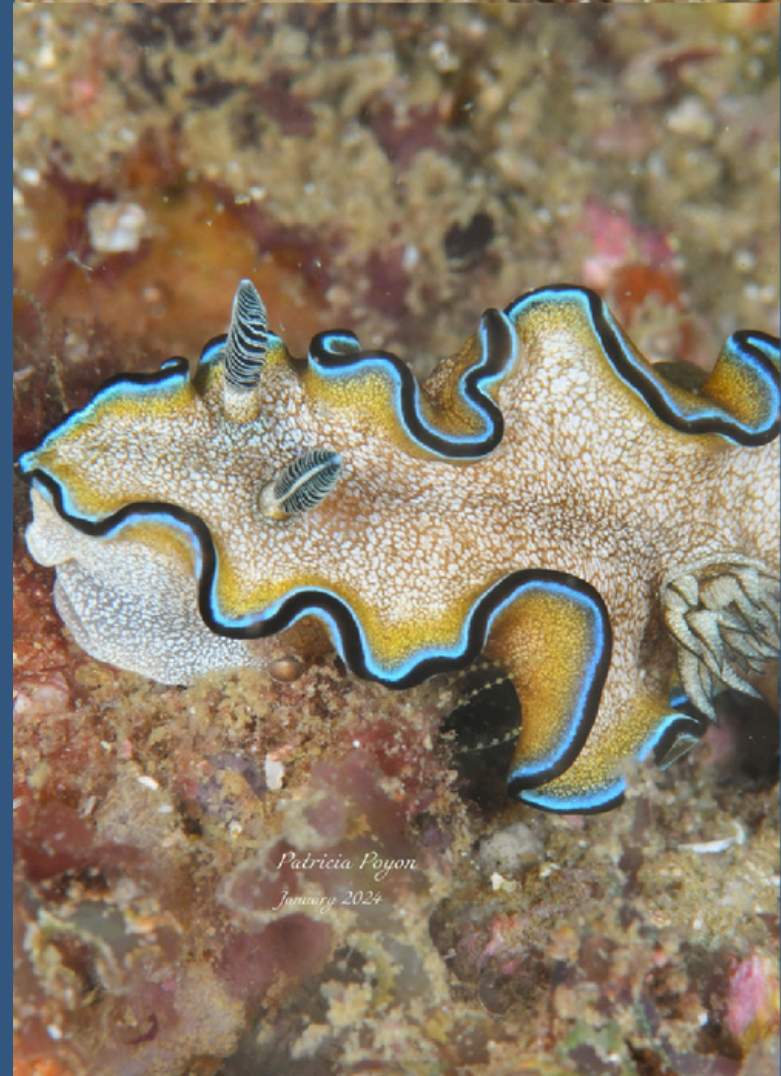
Patricia Poyon January 2024