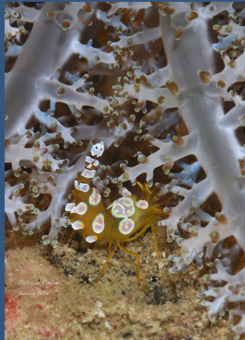
Patricia Poyon January 2024